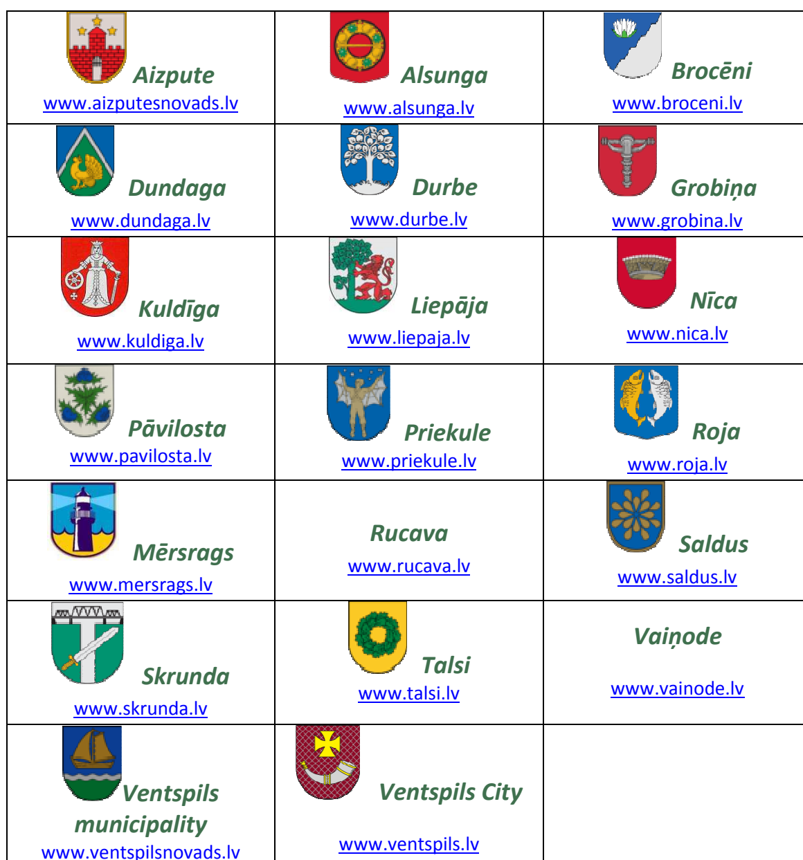
Table 1.2. Municipalities of Kurzeme Planning Region and their home page addresses.

Largest companies of the region are located in Liepāja and Ventspils, as well as in the vicinity of Saldus and Talsi (detailed description of business and overview of biggest companies in the municipalities see in Table 1.3).