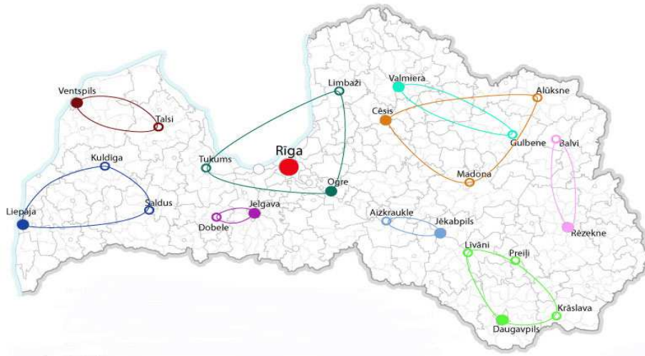
Picture No 2.1. Business incubators in Latvia.

Source: Investment and Development Agency of Latvia