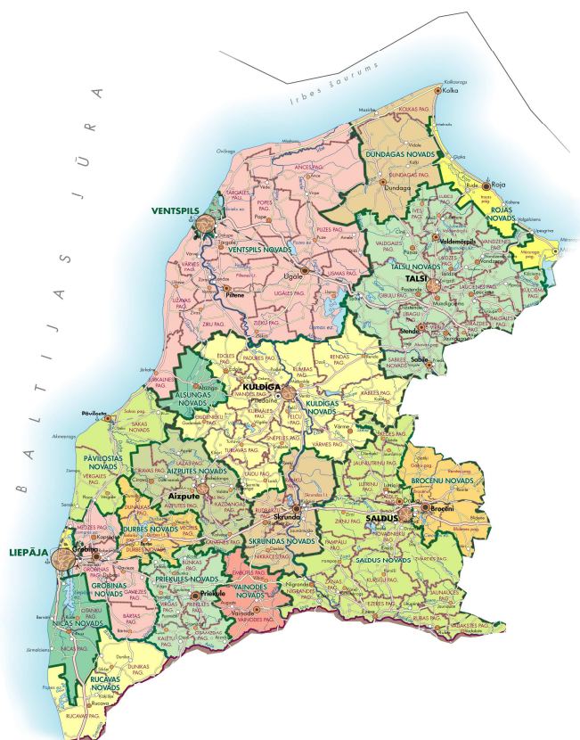
Picture 1.1. Kurzeme Planning Region location and administrative regions (municipalities).

Kurzeme Planning Region (Latvian: Kurzemes plānošanas reģions ) is one of five planning regions of Latvia, situated in the western part of Latvia, at the shores of the Baltic Sea and Gulf of Riga (see Picture 1.1.).